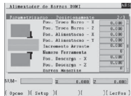
Screen data for positioning

The programming screens for the ABR 80 are interactive, making data input easy.