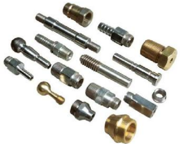
Examples of machined parts from bars