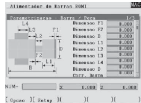
Screen data for bars and parts

Using the key, Custom Graph, it is possible to access the display of the programming of the ABR 80.